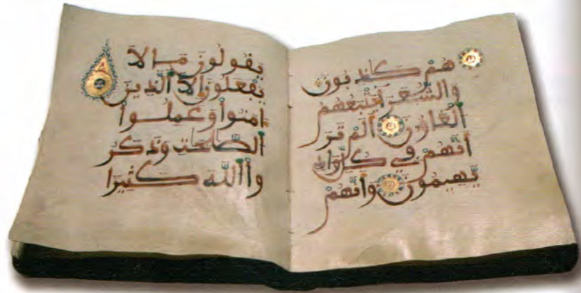
A The Quran, (also spelled Koran) is the holy book of Islam. It includes basic religious duties of all Muslims.